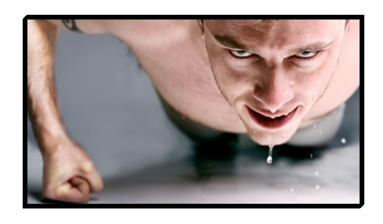
THE INSANE S.W.E.A.T CLUB 40 Days To A Leaner Spiritual Life