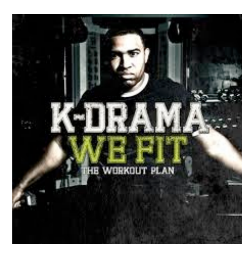
Check out K's website HERE

For even more ways to use this material check out <u>The Sweaty Bible Study</u>